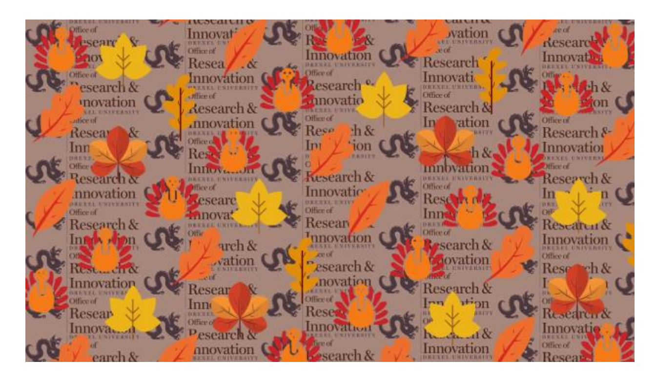
Office of Research & Innovation Newsletter · November 2020