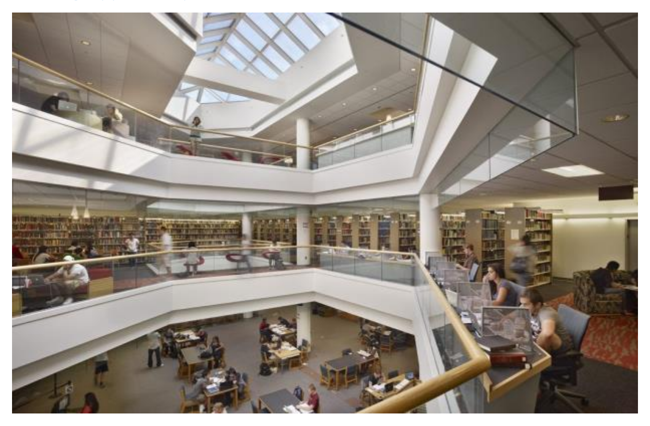
Grant Announcement from Misophonia Research Fund

The Milken Institute, in collaboration with The REAM Foundation, is administering a grant program focused on misophonia. The Misophonia Research Fund, e stablished in 2019, has already awarded thirteen grants, equating to over $4 million of funding disbursed. The program supports two-year projects led by either faculty or postdocs with annual budgets of up to $200,000. Funded projects include: